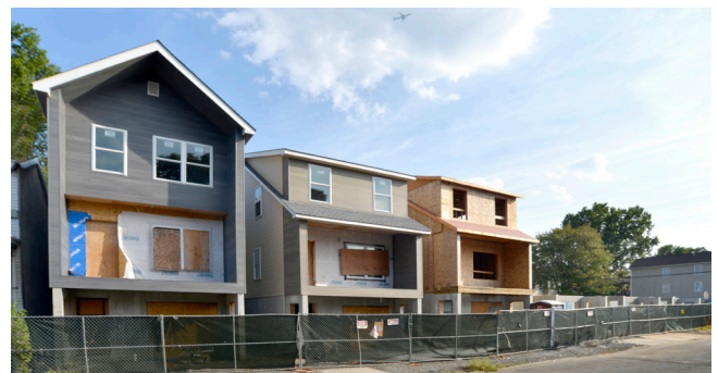
Hamilton 7 Project (FY20)

During fiscal year 2020 all of these initiatives will be continued and expanded as we work to revitalize a neighborhood and create a community in the 4th Ward that families want to call home.