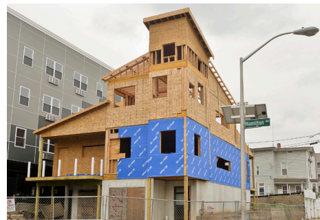
Corner of Hamilton Ave & Straight St